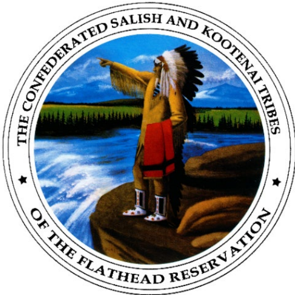
A People of Vision