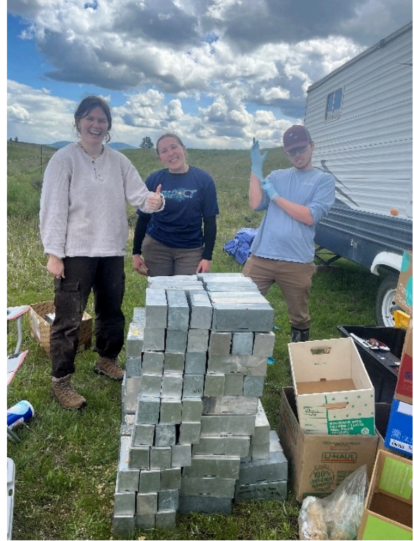
Three undergraduate technicians standing by freshly baited Sherman traps.

Thanks to the gracious support from the 2024 MT-TWS Grants, we were able to purchase Dulog transmitters to track deer mouse contacts in semi-natural enclosures. Deer mice are the reservoirs for Sin Nombre Virus, a deadly disease in humans but an ideal model for wildlife disease dynamics. Dulog technology is an innovative and novel method to track small nocturnal animals; traditionally, small rodents have been excluded from this type of research due to the size constraints of the available technology. The tiny Dulog transmitters emit beacons that are detected and recorded by nearby transmitters, recording both the animal identity and the distance between the transmitters.