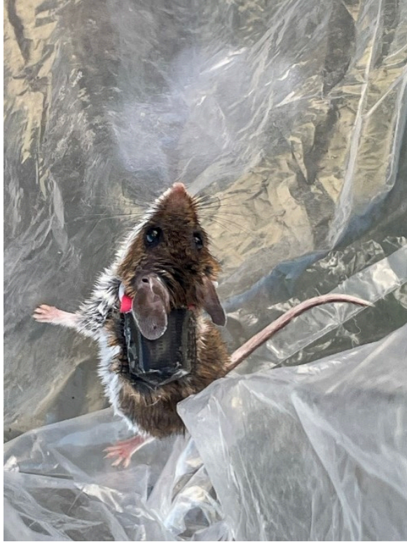
Deer mouse with Dulog transmitter inside a protective casing.